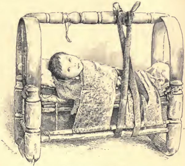
A PERSO-BAKHTIARI CRADLE.

most orderly way. The infants are put into their cradles, the men clear the ground if necessary, drive the pegs and put up the poles, and if there be wood—of which there is not a stick here—they make a fence of loose branches to contain the camp, but the women do the really hard work. Their lords, easily satisfied with their modicum of labour, soon retire to enjoy their pipes and the endless gossip of Bakhtiari life.